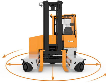
360° steering in place